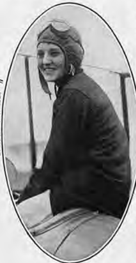
MISS RUTH ELDER

The plucky American woman pilot who was rescued in dramatic circumstances during her attempt to fly the Atlantic. She flies a Stinson-Detroiter monoplane